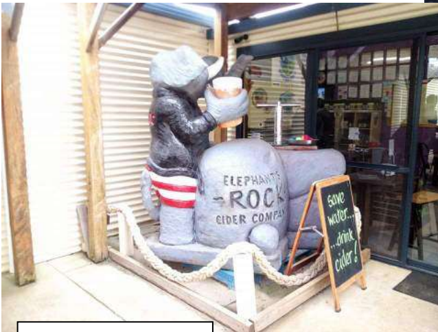
Elephant Rock Cider

Two others have been on the Great Ocean Walk so here's hoping for a report of their efforts also. (This was gleaned from a Facebook posting!).