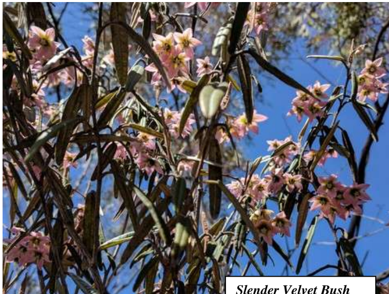
Slender Velvet Bush Lasiopetalum baueri

Mt Henschke is a favourite destination on the SBW walks program and I am sure we will enjoy its rare, local status again, sometime in the future.