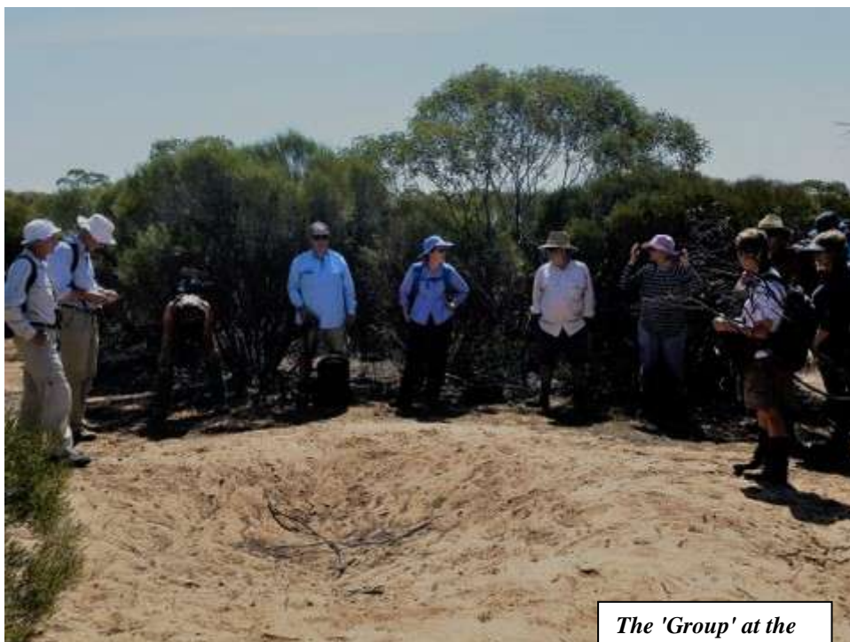
The 'Group' at the Mallee Fowl nest