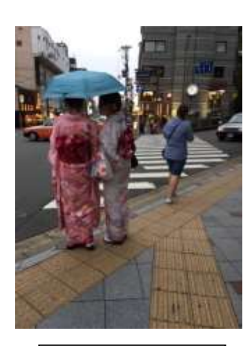
Tokyo Street scene