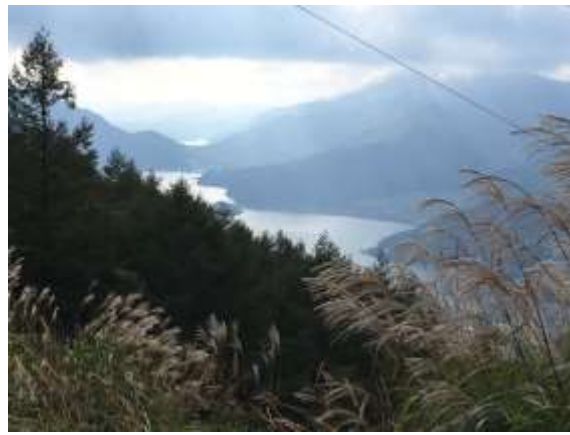
The 5 Lakes area near Fuji