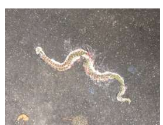
I hadn't expected snakes!!

My friend and I spent another 10 days in Japan using the magnificent and reliable public transport system (including the shinkansen bullet trains) and 'shanks pony' to get around as well as cycling around the art island of Naoshima. We managed to join the local female population in a public onsen in Matsuyama which we believe is the oldest public bath in Japan. Not for the very modest but a truly humbling and liberating experience.