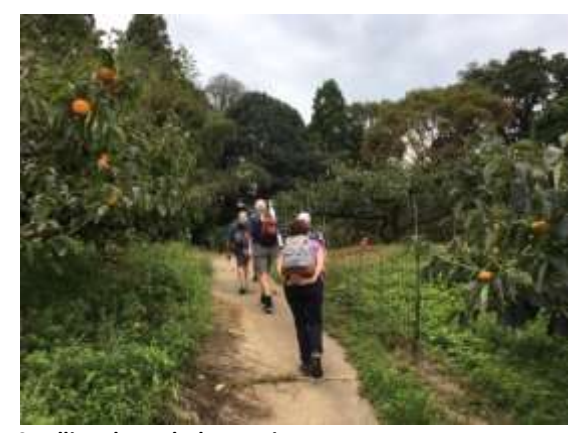
Strolling through the persimmons