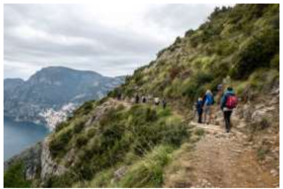
'Walk of the Gods' - to Positano 3<sup>rd</sup> walk

The advantage of walking in winter is obviously the lack of crowds but this also meant that some of the optional activities were not available due to closure or inclement weather e.g. trips to Capri and the crater of Vesuvius. However, visits to Pompeii and Herculaneum were fantastic and had been on my bucket list for years.