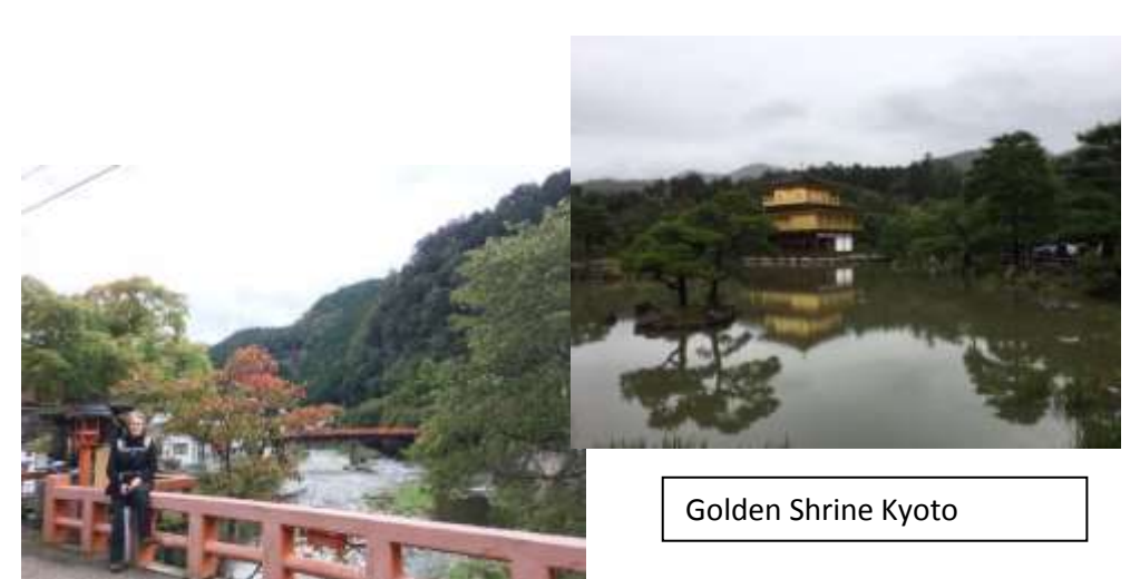
Mountain village - start of autumn