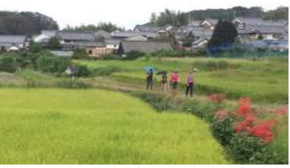
Gentle walking in the Nara valley