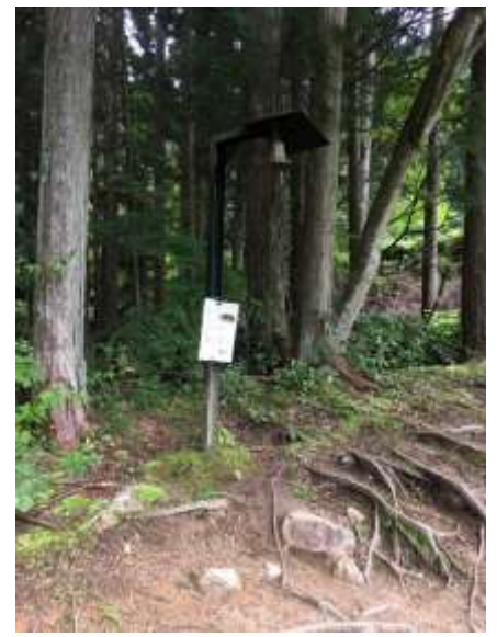
One of the 'Bear Bells'