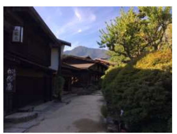
Village along the Nakasendo Way