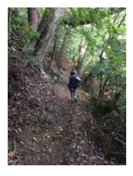
Typical walking conditions