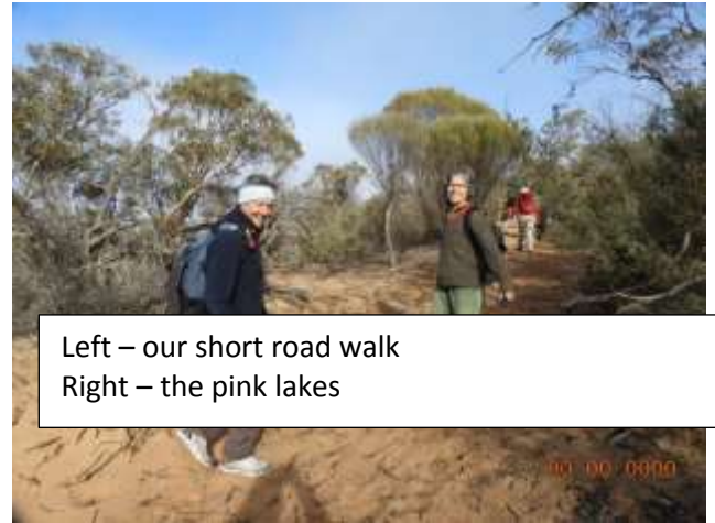
Left – our short road walk Right – the pink lakes