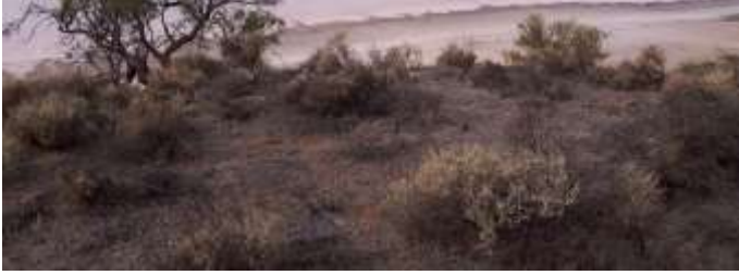
Above - the tessellating patterns on Lake Crosbie Top right – our leaders Bottom right – the camp Below – farmland from the top of Mt Jess