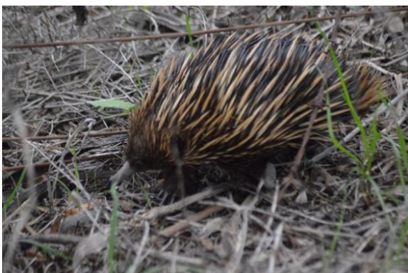
This echidna was spotted near Ouyen.

The wattles are out, it must be Spring !