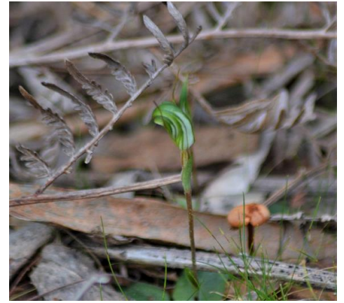
Green Capped orchid