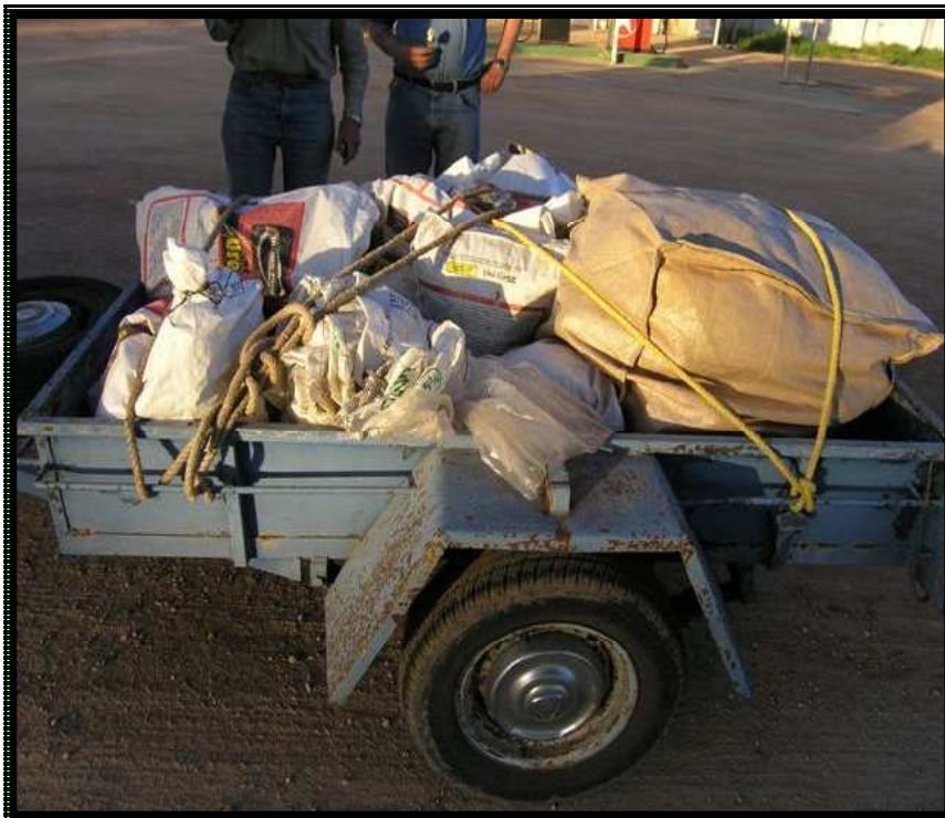
The first crop of weeds harvested on its way to the Mildura tip

All plants collected were dumped at the Mildura Landfill. For the information of the MCMA two of our members on 18th May observed a population of Noogoora Burr at Kings Billabong where the Eastern end of the billabong meets the walking track that ends at Psyche